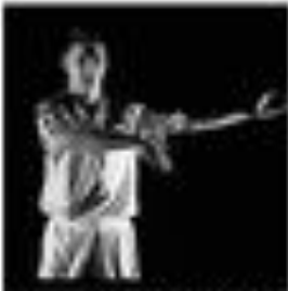
Over-stepping Mark (1)