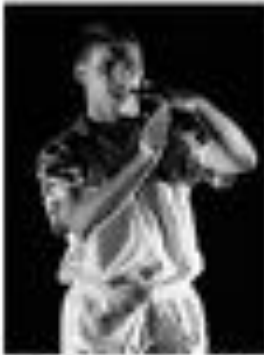
Period Dismissal (1)