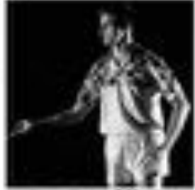
Location of Mark