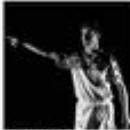
Period Dismissal (2)