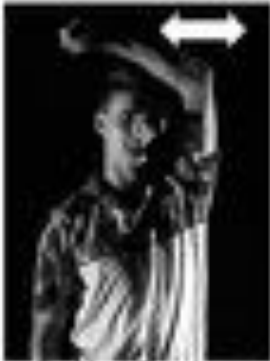
Six More Touches