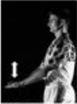
Ball to Ground