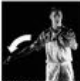
Over-stepping Mark (2)