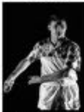
Forward Pass (1)