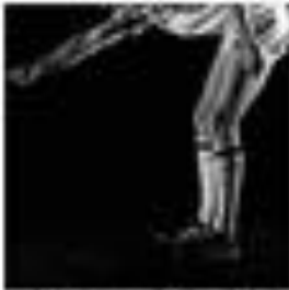
Incorrect Rollball (1)