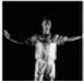
End of Match