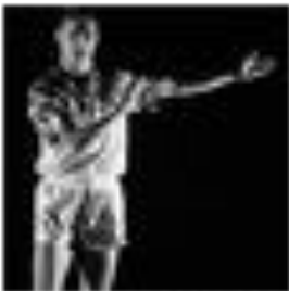
Penalty - Offside (1)