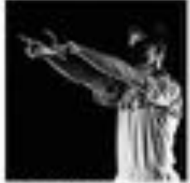
Rest of Match Dismissal