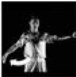
Penalty - Offside (2)