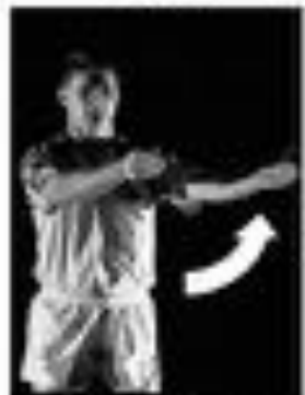
Forward Pass (2)