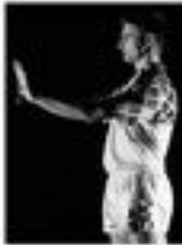
Defenders Back 10M