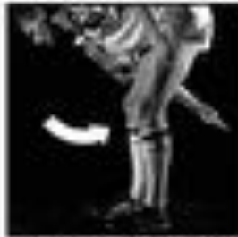
Incorrect Rollball (2)